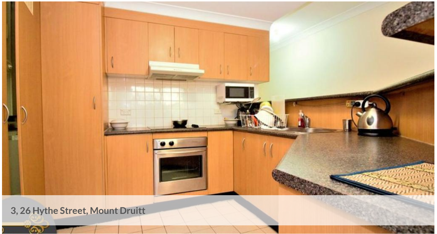
3, 26 Hythe Street, Mount Druitt